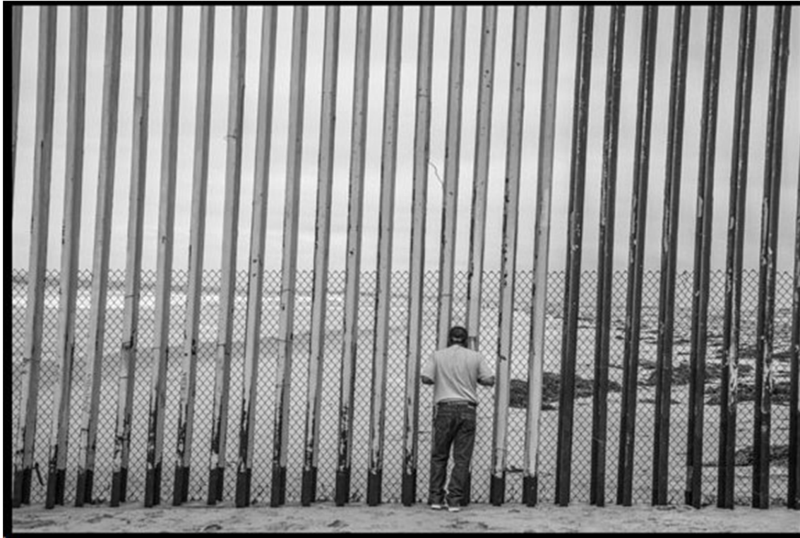
Figure 1: A Tide of Return by Alex Majoli.

expenses, difficulties in obtaining employment and accessing state services, learning a new language and new customs. 6