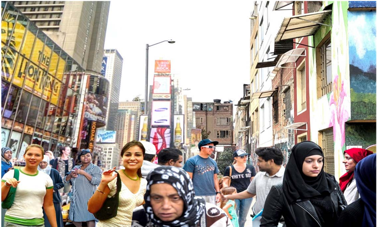
Figure 3: Collage by XCOOP

goal is a community that collectively and efficiently uses its resources to facilitate growth and inclusion (Zanghi, 2016) 23 .