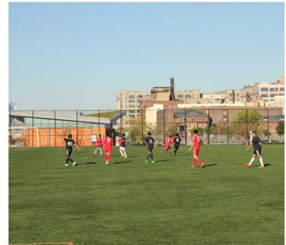
F. Athletic field