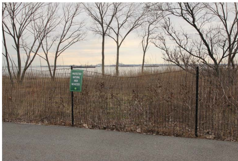
Figure 4. The range fence that separates a pathway in the park from the protected natural area, with physical traces of users crossing the barrier and ad hoc repair to the fence with bailing wire (by the Author).

In the end, they decided to leave the trees up, bury them in soil, let them slowly die over time, but also plant other trees between them. So that was their way of preserving ecosystem services of the trees as the older ones died from strangulation from lack of oxygen. The challenge that created, then, was that you could have a potential for a tree that’s dying falling on somebody and injuring them. So the park created this artificial line right here where they couldn’t let people go into it. Because they’ve created a hazardous condition by their unwillingness to grapple with the environmental remediation. (Designer #2)