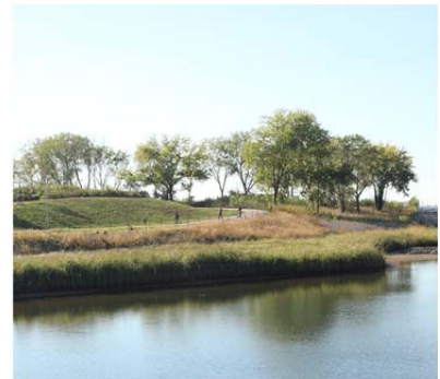
C. Tidal pool and hill