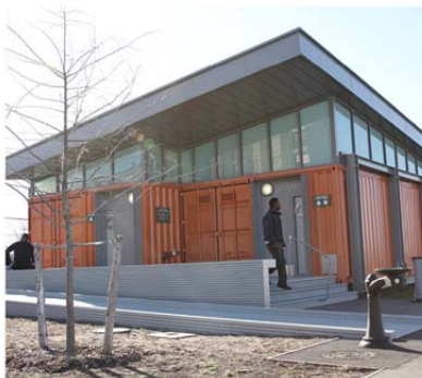
H. Comfort station