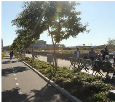
B. Entry pathway