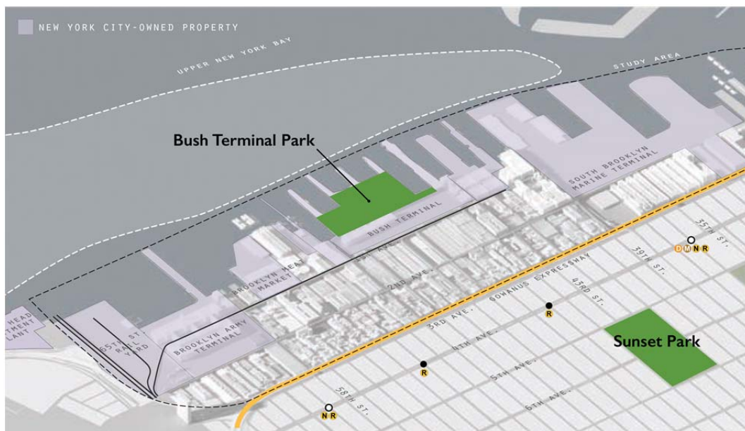
Figure 1. Bush Terminal Park in relation to the Sunset Park neighborhood, including the Brooklyn Army Terminal, Brooklyn Marine Terminal, Gowanus Expressway, and Sunset Park (The City of New York, 2009, p. 9, modified by the Author). Note: The boundaries and names shown and the designations used on this map do not imply official endorsement or acceptance by the United Nations.

of color in white neighbourhoods. Additionally, federal funds for infrastructure were frequently steered toward white suburban areas, which left poor people of color disenfranchised, often in urban areas with high concentrations of industrial facilities. The combination of the structural transition away from a manufacturing-based economy and environmental legislation in the 1960s and 1970s then led to drastic job losses in such communities, yet the noxious remains of previous industrial uses remained. Quantitative analyses of the locations of hazardous sites in the United States indicate they are more common in minority areas today, even if the links between poverty and such hazards are more nuanced (Campbell et al., 2010; Ringquist, 2005).