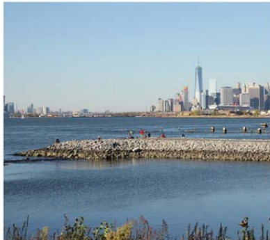
E. Tidal pool, jetty, and city view