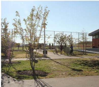
D. Athletic field entry