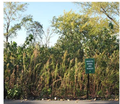
I. Protected natural area