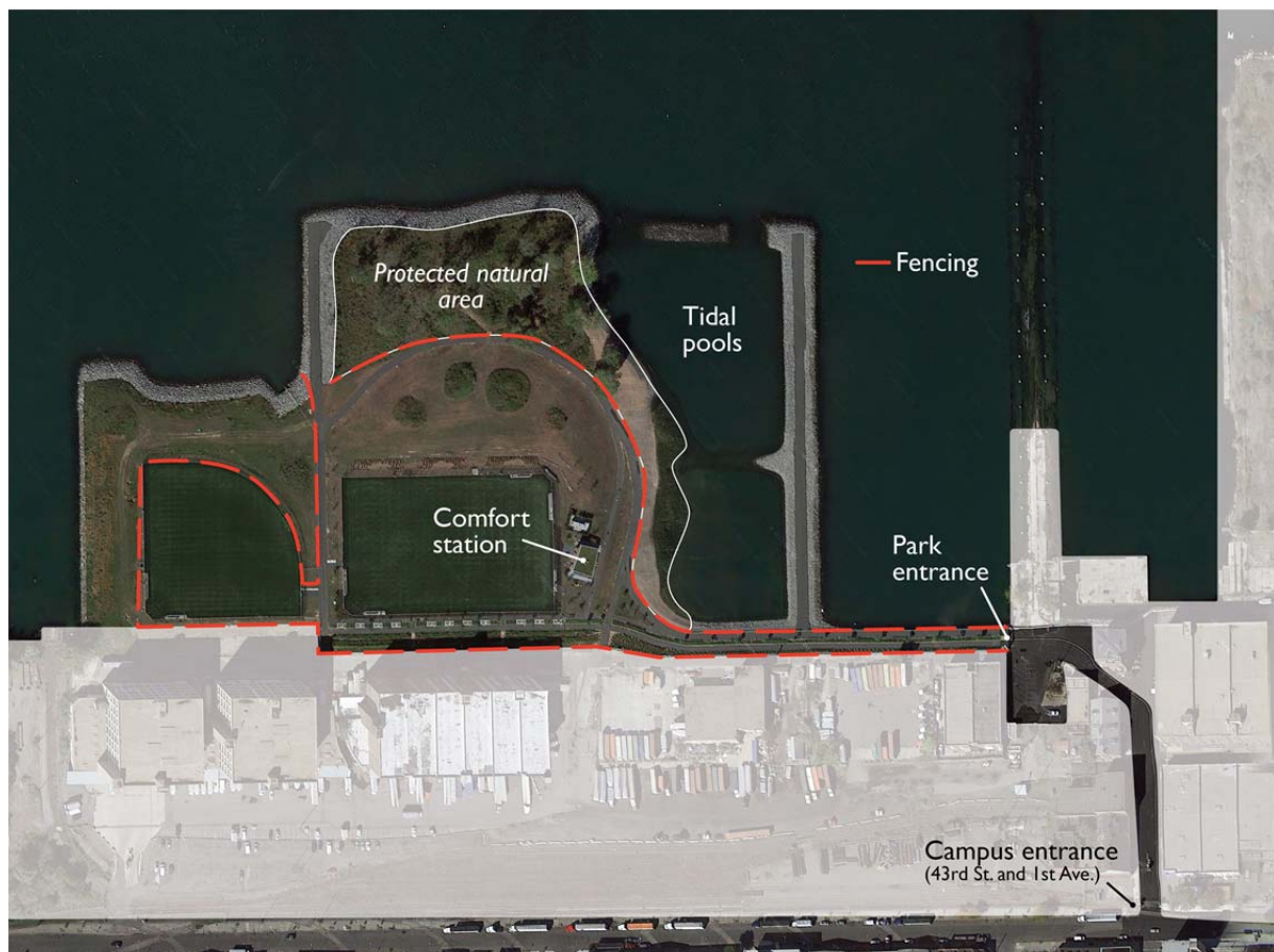
Figure 2. Composite aerial photograph of Bush Terminal Park (Bluesky et al., 2016, modified by the Author). The image illustrates the single point of entry to the waterfront park through the Bush Terminal industrial campus following the park's initial opening to the public. Major features of the park include two athletic fields, a comfort station, the protected natural area, and tidal pools.

Remedial construction began at the site in August 2009 and the Certificate of Completion is dated May 28, 2015 (New York State Department of Environmental Conservation, 2018). According to the Site Management Plan developed by the environmental engineering firm that conducted the testing and remediation of the site, soils and fill materials, as well as groundwater and sediments, were impacted by the presence of polycyclic aromatic hydrocarbons (PAHs) and metals. Methane was also present in soil gases on the site. “As a whole, the petroleum-related compounds, solvents, PAHs, and metals detected in the environmental media at the site are consistent with the alleged dumping of plating wastes and oil sludges at the site during the 1970s” (TRC Environmental Corporation, 2014: 1-7).