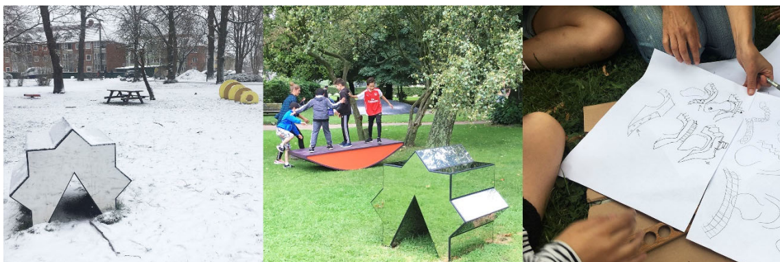
Figure 9. The mirror star-gate and the co-design process of telling and enacting. Negotiations through drawing stories between Winge and three girls.

The creation of the mirror star-gate (Figure 9) is an example of ‘polite visiting’ (Haraway 2015) through design dialogue. A design dialogue of transformative interactions took place between children and drawing. In workshop A, on 1:1 mock-ups, three girls designed a small bridge that also functioned as a seat. Beneath the bridge, they drew a stream, and imagined the sound of water – a poetic fishing opportunity, a place to sit with your BFF next to a watery reflection of a starry sky. The girls performed stories through their drawings.