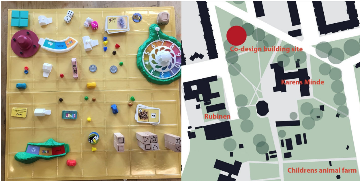
Figure 5. The site from above and a comparison between two representations of the green space: a constructed board game depicting the lawn (left) and a map of the green space. The installations on the lawn were conceived as a board game. Map: Carroza.

One boy built an abstract model with five discs set in a row. He presented it as an 'obstacle course' with different levels, while he 'walked' playfully through it with two fingers to test how to 'play' them (Lamm 2017). On the lawn, the model discs were translated into an installation, and we added holes to open them up for play with a ball (Figure 6). Holes became a recurring theme throughout the design process: models with small holes for the bodily performance of a finger, bigger holes for balls, heads, eyes and bodies.