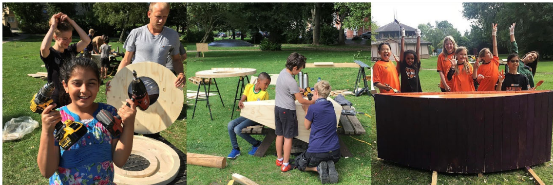
Figure 7. The enactment of capabilities for and decisions about construction. Power play with power tools: making your design together is empowering.

Figure 8 shows three examples of events that seemed ‘messy’ and ‘jelly-like’ in relation to the design outcome. The play itself did not offer any results, but suggested an ‘empirical mess’ or ‘slippery phenomenon’ (Law 2006). These events encouraged us to be curious (Haraway 2016) and see how the more-than-human world would play out, and therefore freed up the fieldwork. They cannot easily be described using the logic of