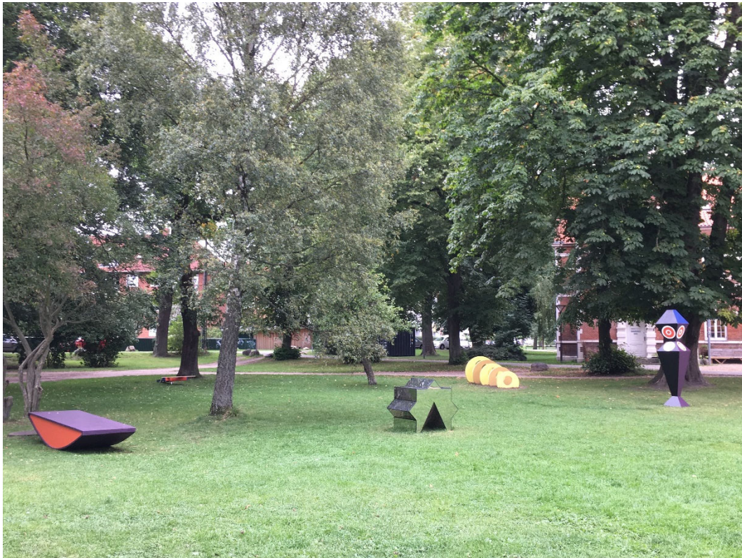
Figure 2. The playscape.

The co-design workshops explored future scenarios for the community site. The outcome was five wooden figures set amongst the trees. Combined, they created a playable social space that included a rocking-boat, an oversized slingshot, a mirror star-gate, a tetherball totem and a line of disc-shaped goals (Figure 2). These became visual destinations that offer different possibilities for playful actions, inventing games or hanging out.