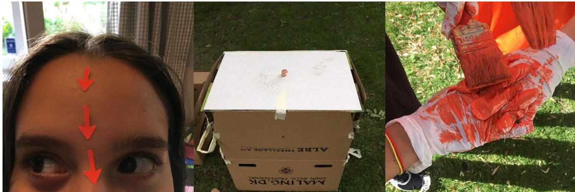
Figure 8. Embodiment with materials: Arrows on a forehead, a finger emerging from a hole. Children engaging with the materials by painting themselves.

design and construction, but they functioned as playful triggers in the design process and informed our thinking about design/play.