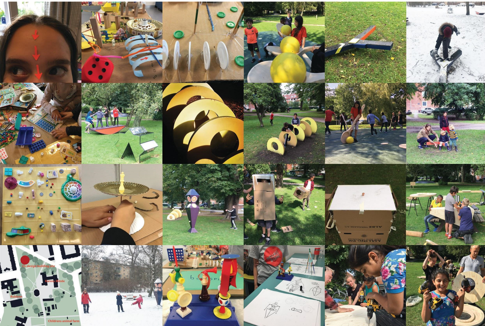
Figure 1. Visual abstract: design matters in an entangled materiality discourse. According to Solnit, artistic work can ‘open doors and invite in prophecies, the unknown, the unfamiliar’ (Rebecca Solnit 2006, A Field Guide to Getting Lost , p.5).