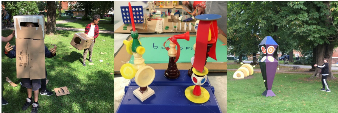
Figure 3. The play and models that drove the tetherball-totem: a boy embodies the material: a character/avatar > a model of a living totem > the tetherball-totem.

The becoming of the tether-ball totem exemplifies the intra-action between children, materials and play, where the design/playing with figures and board game pieces transforms into a tetherball totem. The play with 'gaming' and board-game materials activated the children's world-forming design response through a material design/play dialogue.