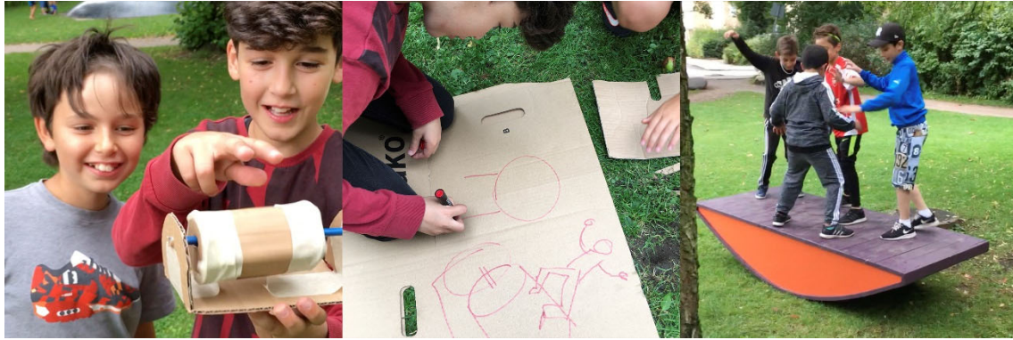
Figure 10. The boys play with their own balance-based invention. Players try to balance on the finished installation, the rocking-boat.

For the mirror star-gate, the dialogue took the form of a long negotiation conducted via drawing. For the rocking-boat, it was a quick ‘design ping-pong dialogue’, a reminiscent of good play of simply throwing and catching ideas.