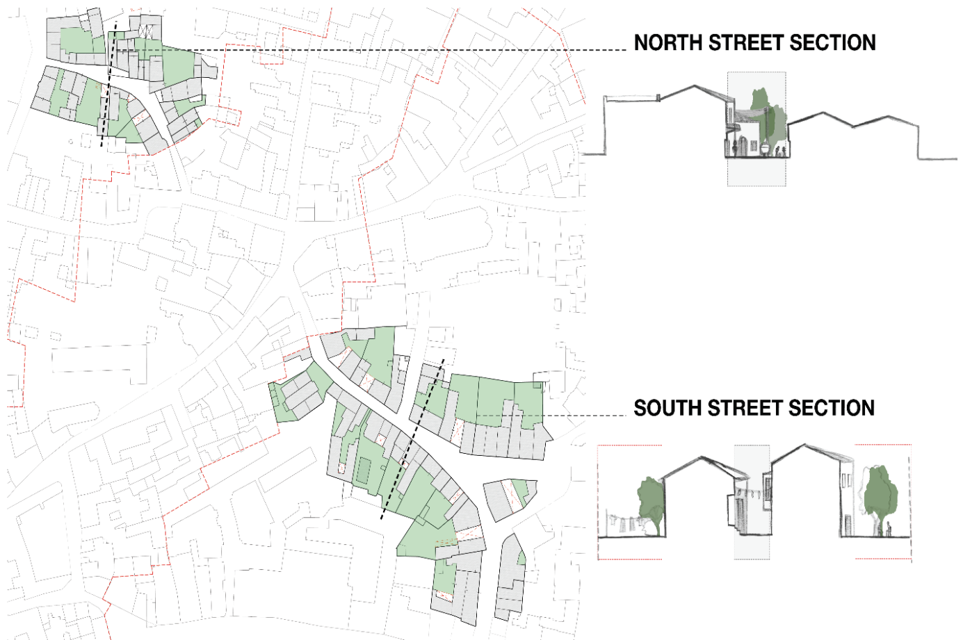
Figure 2. Example of students' analysis (neighbourhood scale): How we see the city and its organisation is defined by the routes we take through it, the memories we relate to certain places and the myths we associate with unexplored areas.

reflection on the analytical work, the students also proposed strategies and concepts for conservation and/or transformation of the existing urban form in the area of Ayios Kassianos, adjacent to the Nicosia's buffer zone. An example of one group's analysis is shown in figure 2, with a proposal in figure 3.