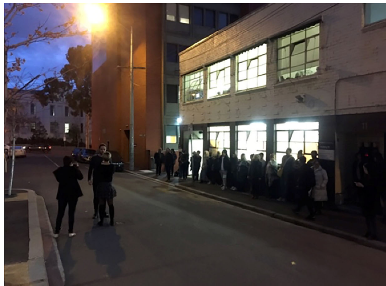
Figure 2. Rip My Flesh (2017), street performance.