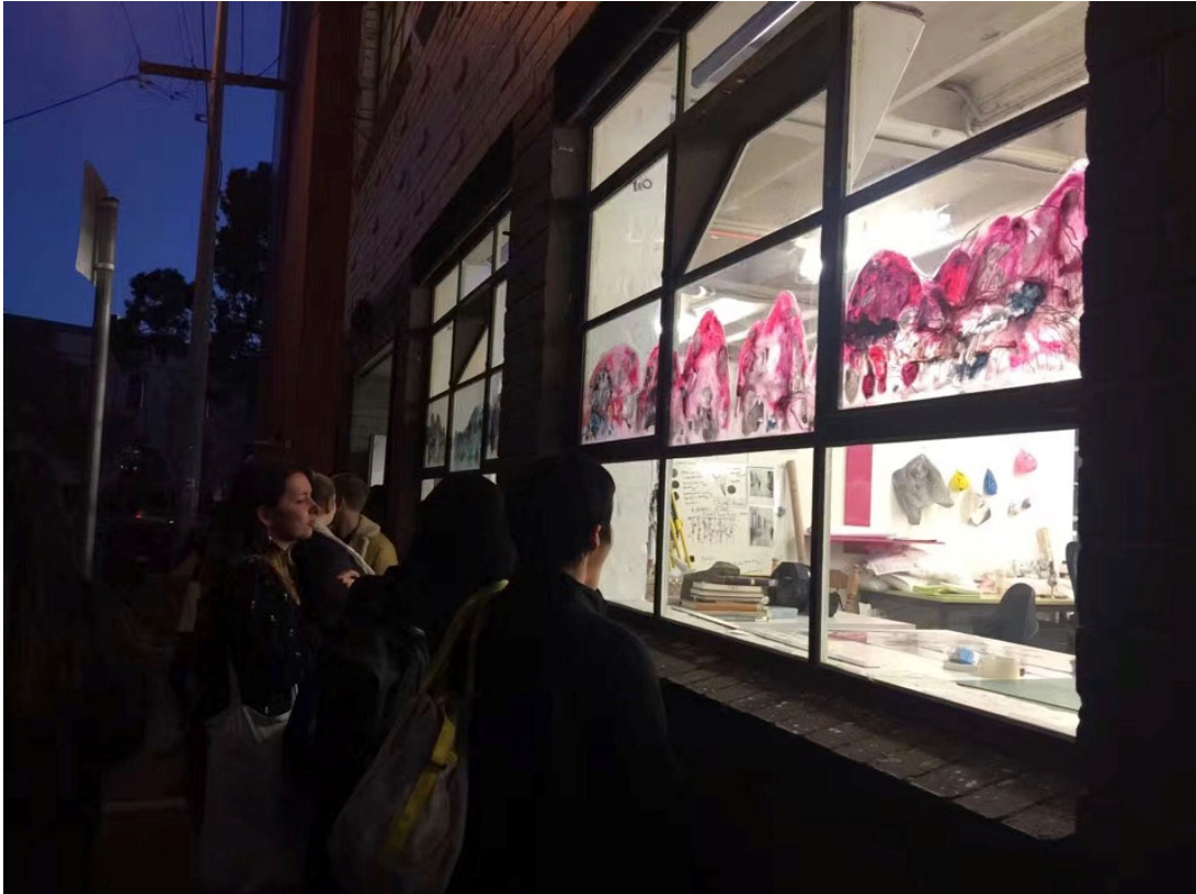
Figure 4. The public viewing Siteng Wei's landscape painting installation on the 'windowscapes' (2017).

The act of 'giving and receiving' reminds me of a theatre idea of 'give and take', which aims to help performers and audience to understand the idea of when to give focus and when to take focus. 'As the culture of give and take between stage and audience is established and the level of trust in the process increase, the conductor may invite a fuller story' (Chesner, 2008, p. 44). I saw that the roles of conductor and curator are the same role in creation. The idea of 'giving and taking' was very beneficial when starting creations related to our site-specific art practice. As an outcome, Wei and I set up a 3-meter-long panoramic installation art in the 'windowscapes' and linked this to a public theatrical event on the opening night of PS50 exhibition [Figure 5]. We turned the lane behind building 50 into an open-air theatre to perform Liu's Chinese shadow puppets plays and Wang's happenings [Figure 6, 7, 8, 9]. The idea of 'giving and taking' assisted me to establish a collaborative curatorial method with artists in public space through artistic activation.