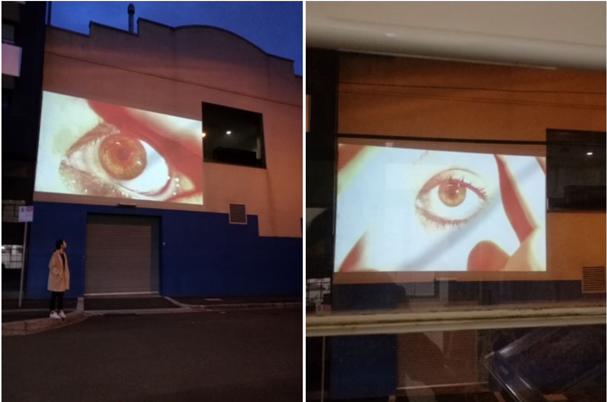
Figure 3. Rip My Flesh (2017) wall projection.