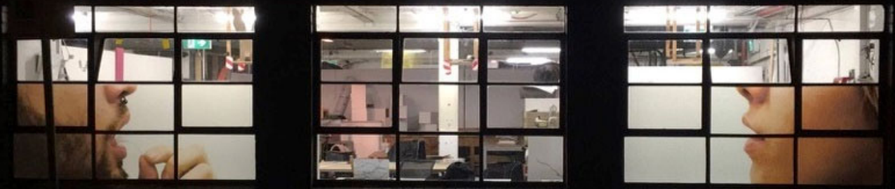
Figure 1. Rip My Flesh (2017), installation art.

This idea appeared in the performance of Salas and Garcia, which took place on the street in front of 'windowscapes' [Figure 2]. In addition, we also projected a short art video on the wall opposite to Building 50 [Figure 3]. Through this expanded artistic practice in public space, I observed that the window is a gateway that follows the building and can be connected to another unknown world outside the building. I realized this kind of 'in-between' relationship that establishes connections between different worlds is the same as exploring unknowable creations with artists in my curatorial practice. In the process of activating the performance, I learned that the role of the curator is not only the commander of the exhibition; sometimes, the curator can be the 'accompaniment'. This investigation reminded me of what Obrist said, 'I really do think artists are the most important people on the planet, and if what I do is a utility and helps them, then that makes me happy. I want to be helpful' (Roberts, 2009).