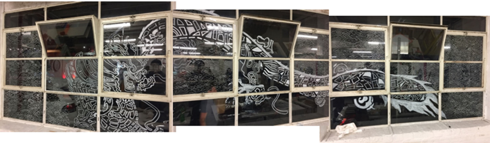
Fig. 11. The final draft of Zhang and Buntoro's mural from the view of PS50 studio (2017).