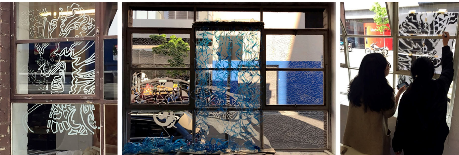
Fig. 10. The working process of Zhang and Buntoro’s mural on PS50’s ‘windowscapes’ (2017).

When I collaborated with Zhang and Buntoro to create a mural on PS50’s ‘windowscapes’ [Figure 10, 11], I found that we have different ideas about the display format of the mural, which is a good thing. However, since we tried to satisfy everyone’s expectations for the project and the voices of the authors, we did not truthfully express our ideas about the artwork in our collaboration. Therefore, during the production, we lost the tacit understanding and encountered many coherent misunderstandings. Communication problems are important reasons for project failure. The lack of methods to evaluate project communication performance hinders the project communication. Sometimes curators and artists have much self-awareness in creation. If the collaborators cannot communicate truthfully, it will harm the production process. These negative emotions will stifle creativity in artistic collaboration. From this experience, I realized that collaborative curatorial practice not only involves creating exhibitions but people’s mutual care and sincere communication.