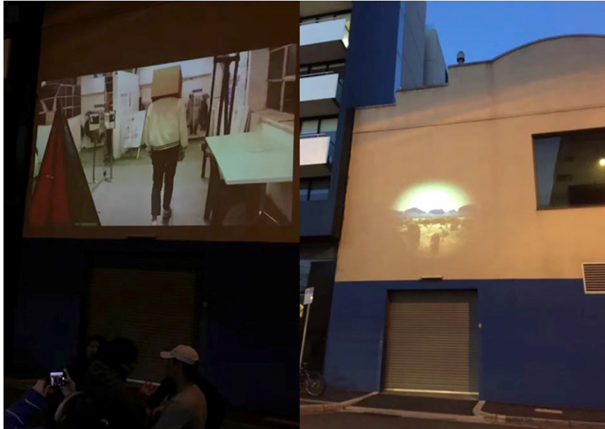
Fig. 6. Saki Wang (L) and Siteng Wei (R) projection artworks on a wall opposite to the building (2017).