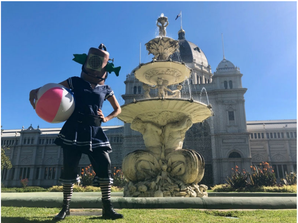
Figure 7. Fountain Flaneuse. Hochgurtel Fountain, Carlton Gardens.

In the next iteration I am running the city. I wanted to run the city for the cause of Bloomerism. as a way to acknowledge these female dress reform campaigners of the past. Blooming Fast, wearing black and carrying a bloomer flag, wanted to literally carve out a silhouetted space for the women of the past. I wanted to have this character running not walking the city, as running in this congested space seemed like a subversive act. Running to me, harnesses a sense of power and freedom in a way that walking may not. And running, when not in running clothes interestingly becomes something completely different and somehow dangerous. This incursion became another retrospective performative recovering of space as I was running for those women of the past. The Fountain Flaneuse was a summer iteration that I created to playfully push the boundaries of public space. The incursions occurred at the Hochgurtel Fountain by Josef Hochgurtel, 1880 and the William Stanford Bluestone Fountain, 1870. These fountains built in Colonial times, were built to evoke a sense of grandeur. I wanted to put the female form into these spaces and I liked the idea of questioning the function of these fountains.