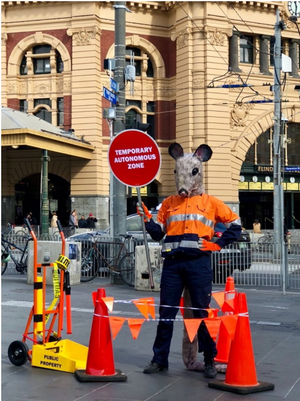
Figure 8. The Envoy of Mischief. Swanston St, Melbourne, 2018.

Why is the fountain a space for just looking when we endure 40 degree days of heat? Are sites of play in the city only for the young and in designated playgrounds? Where are sites of play in the city for adults? Sometimes children transgress the boundaries of the fountain but rarely adults. Why is this? What other boundaries of the city do we unconsciously adhere to? By using the fountains for play I am producing spaces of representation that oppose the official representations of space and thereby making a performative claim to recover the space.