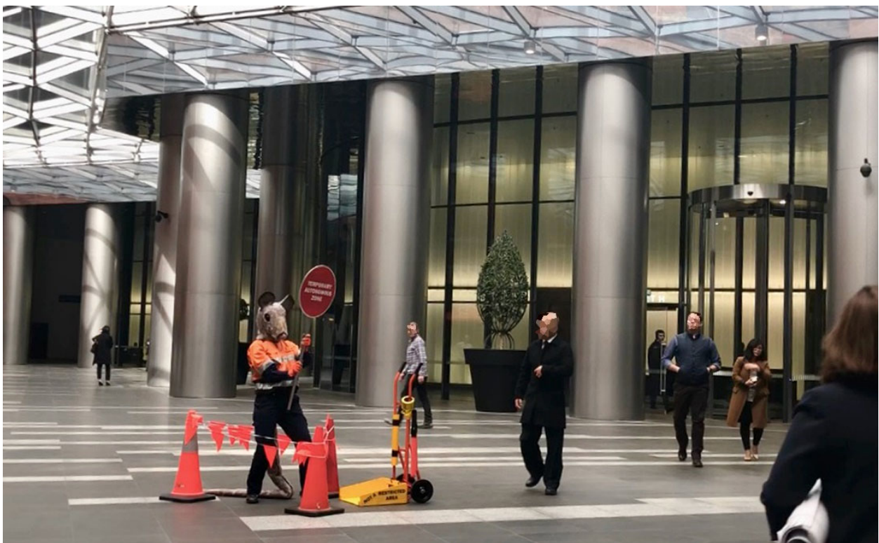
Figure 10. The Envoy of Mischief. Lobby of The Melbourne Stock Exchange, 2018.

The first site that the Envoy claimed was at Federation Square where at the time, an Apple store was threatening to encroach on this space. Among the other many zones secured was the lobby space of the Melbourne Stock Exchange where the rat was asked to leave by security and the steps of Victorian Parliament where the Police also asked her to leave. Both of these encounters were fairly benign yet they make visible the invisible boundaries of 'acceptable' use of public space. In the Rat's performative claim to space in these sites, the representations of space are resisted and could be said to be made more expansive in these moments. I also consider these interactions as disruptions to the consensual surface (Mouffe 2007). At these moments where authority steps in to remove the rat, the hegemonic powers within that space are revealed.