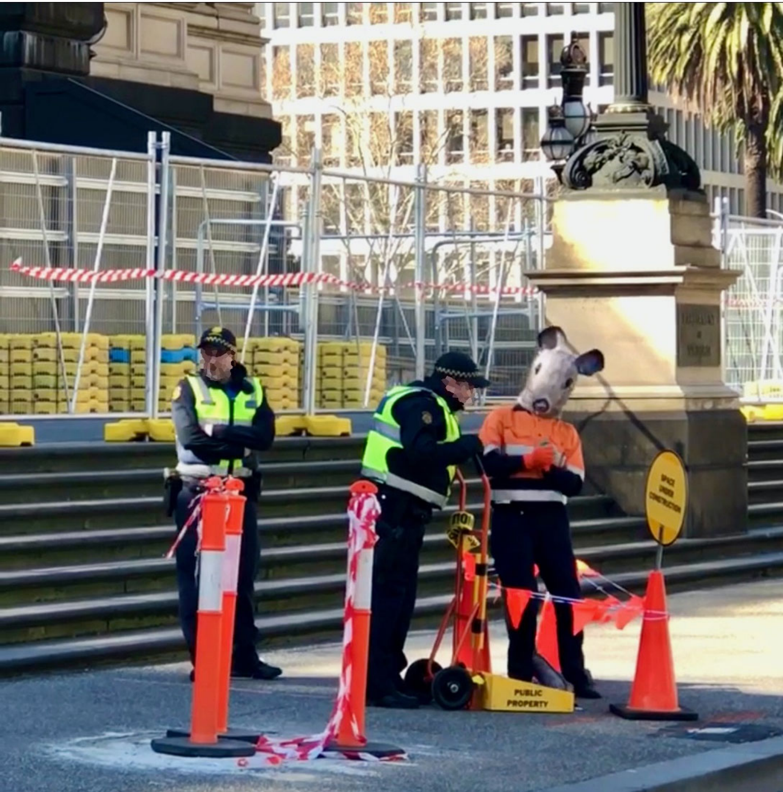
Figure 11. The Envoy of Mischief. Steps of Victorian State Parliament, 2018.