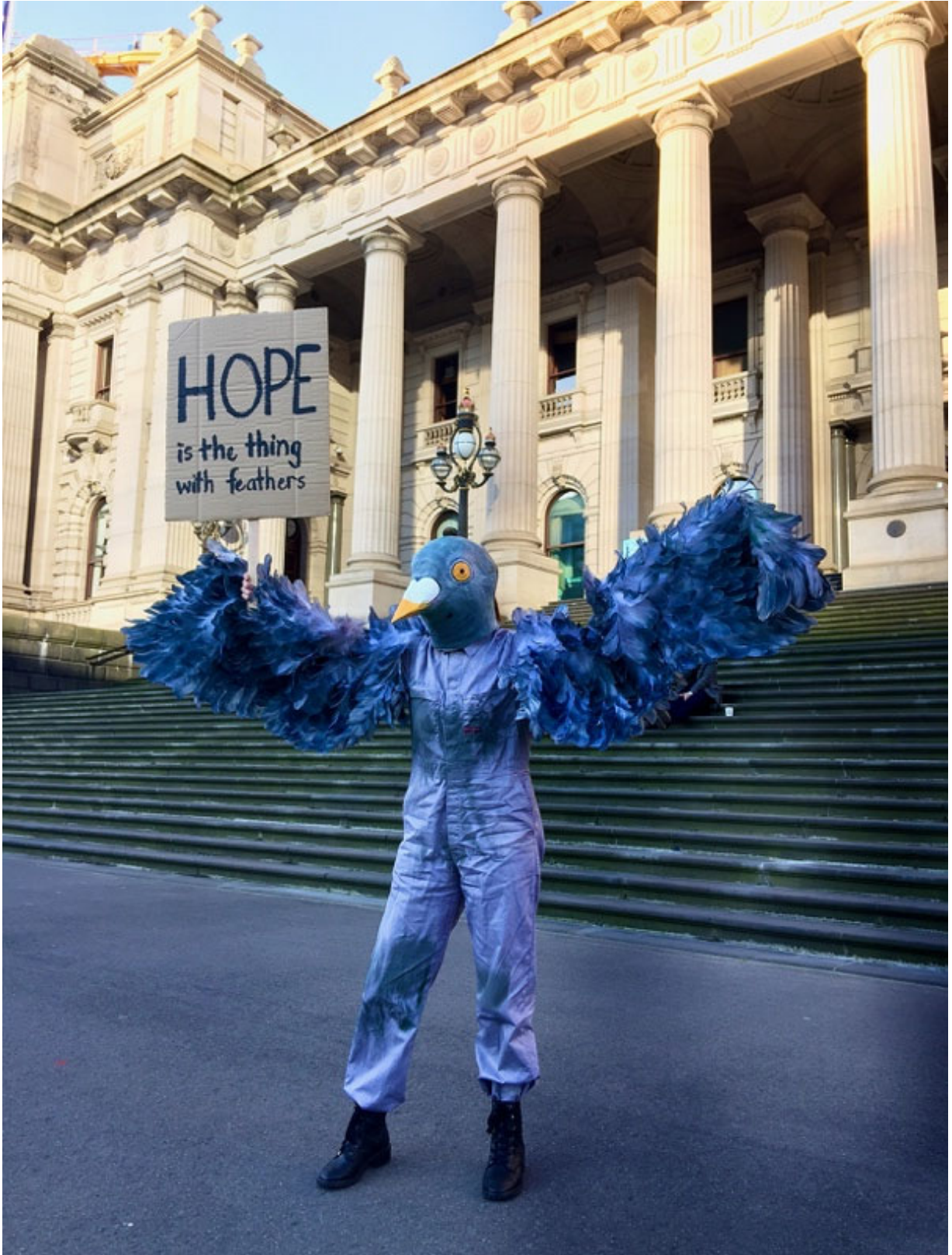
Figure 3. The Protest Pigeon. Victorian State Parliament, 2018.