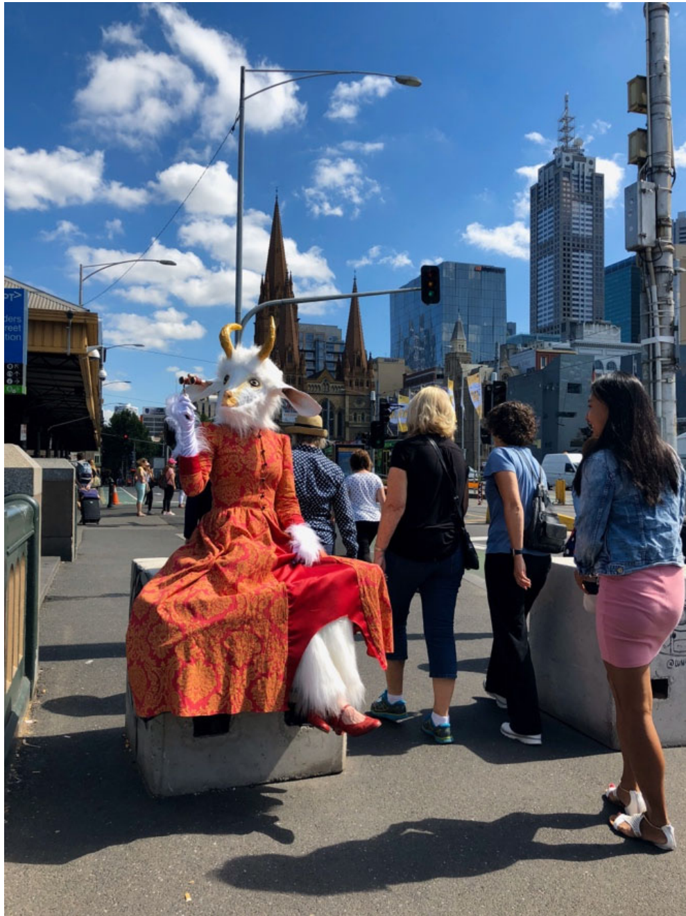
Figure 5. Fairytale Goat. Prince's Bridge, Melbourne 2018.

There is a power in the ridiculousness of asking a pigeon protesting about hope to leave the space. I also propose that by creating protests that don't read as a standard protest, not only may I at times trespass in places others may not, but hopefully the public may be more receptive to the work by using humour to disarm and engage. Here, I have foregrounded the notion of public space as a 'battleground' (Mouffe 2007), as I have revealed in this moment, the space as a contested site. After this experience, I began to think more consciously about how I might expose some of the invisible boundaries of public space.