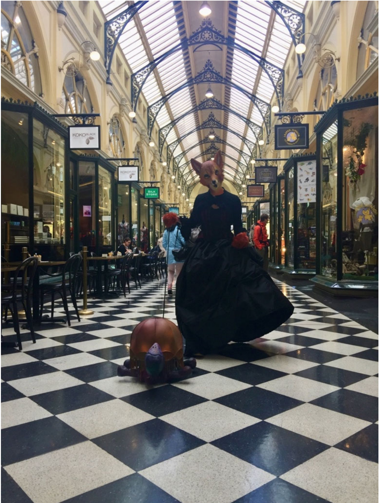
Figure 2. Flaneuse Fox and Croissant the Tortoise. Block Arcade, Melbourne 2017.