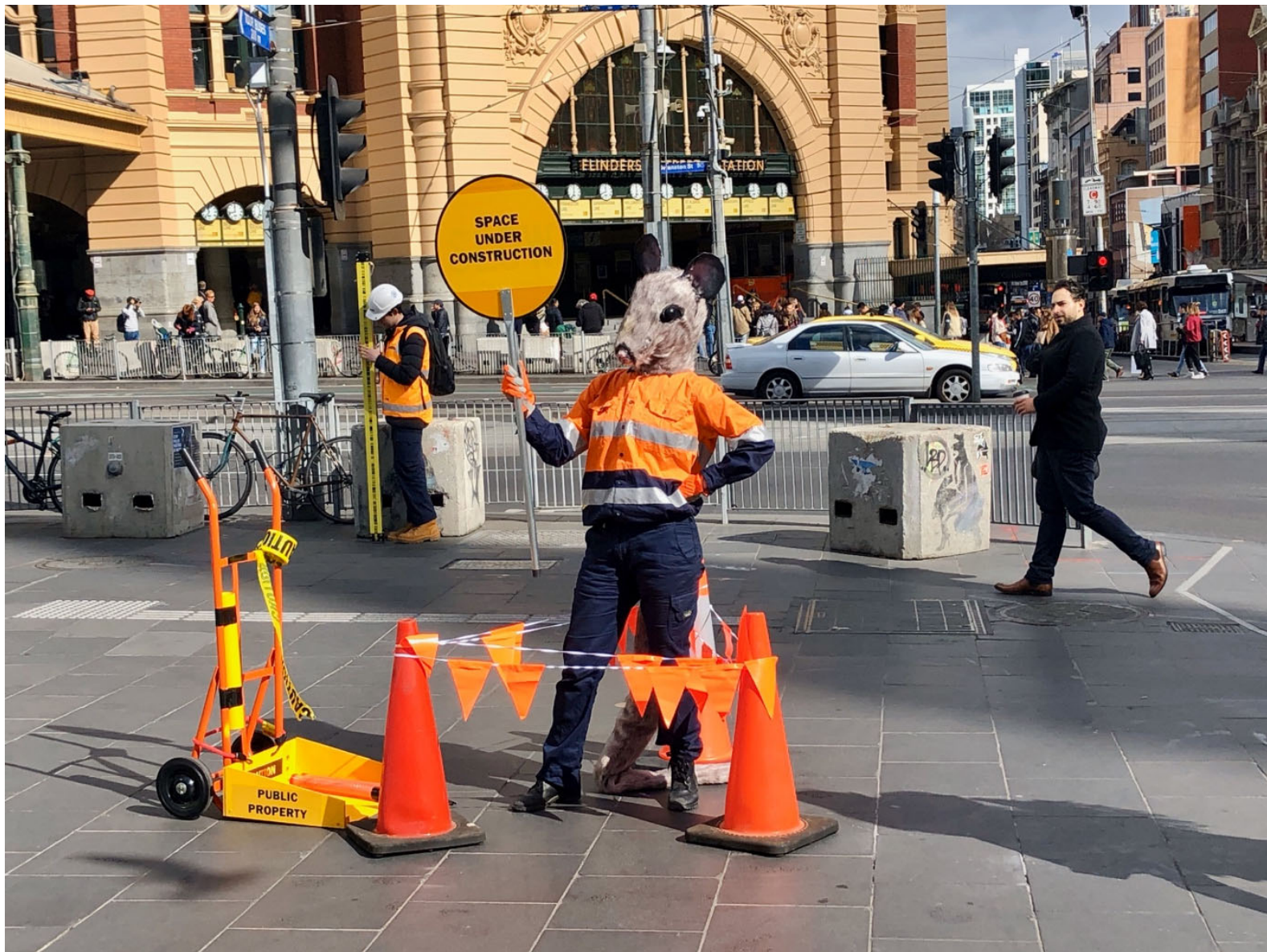
Figure 1. The Envoy of Mischief. Swanston St, Melbourne, 2018.

In this portfolio I briefly outline my art practice, the theoretical frameworks that I have drawn on in my exploration of public city space, and the works that were created over the course of my Master of Arts (Art in Public Space) at RMIT University, Melbourne, Australia, as I posit the notion that one citizen has the potential to disrupt, create and recover public city space. In Play in Melbourne City I am making a performative ‘claim’ to space through a series of playful and humorous incursions which attempt to resist and protest representations of space and ultimately shift the public imaginary. The incursions endeavour to harness the power of the carnivalesque and to act as a reminder that nascent within the lone citizen lies the capacity to disrupt, create and recover public city space.