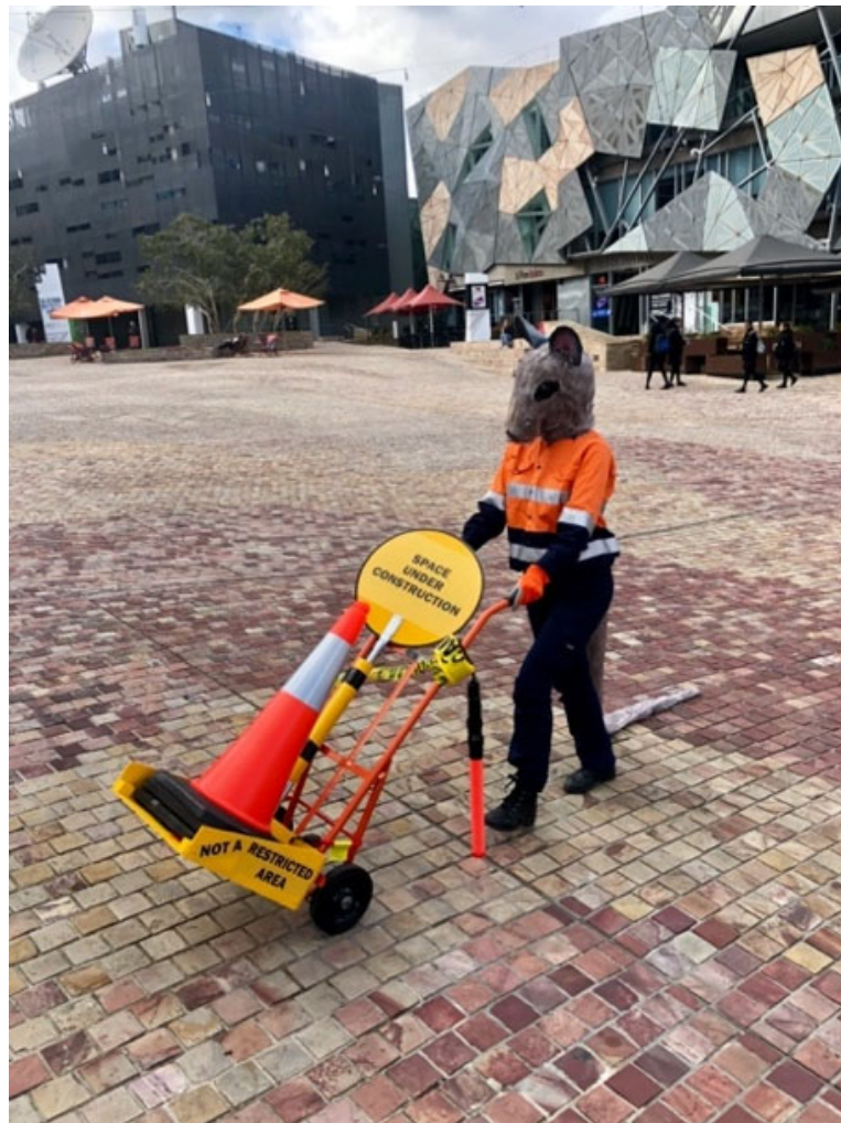
Figure 9. The Envoy of Mischief. Federation Square, Melbourne, 2018.

This description sits eloquently with The Envoy's act of poetic terrorism in that the Rat creates these zones throughout the city then packs them away to move on to the next.