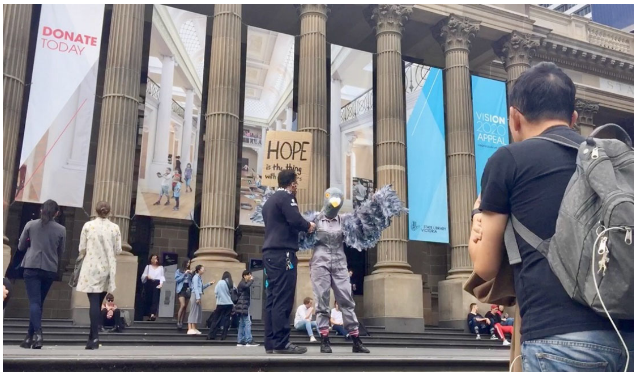
Figure 4. Protest Pigeon. State Library, Melbourne, 2018. (face of security guard has been pixelated)