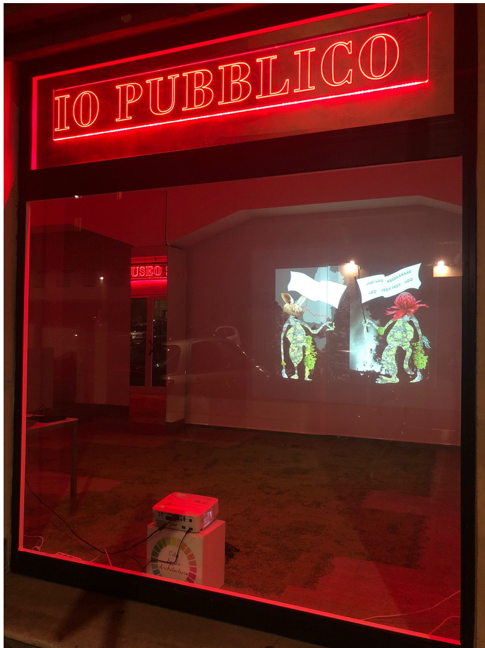
Figure 11: Installation view of Instructions for public space...unusual times, 2021, Public Space Museum, Bologna, Italy, hosted by City Space Architecture.

My Children of Compost Symbionts travelled from Australia to Italy through the project “Instructions for public spaces....unusual times”. This project was a collaboration between the Public Space Museum, Bologna Italy, RMIT School of Art, Master of Arts – Art in Public Space, Melbourne, Australia and the London Metropolitan University’s Master of Public Art and Performance, UK. The concept was to create a Covid-19 response to public space in these unusual times through participating artists offering creative instructions to people.