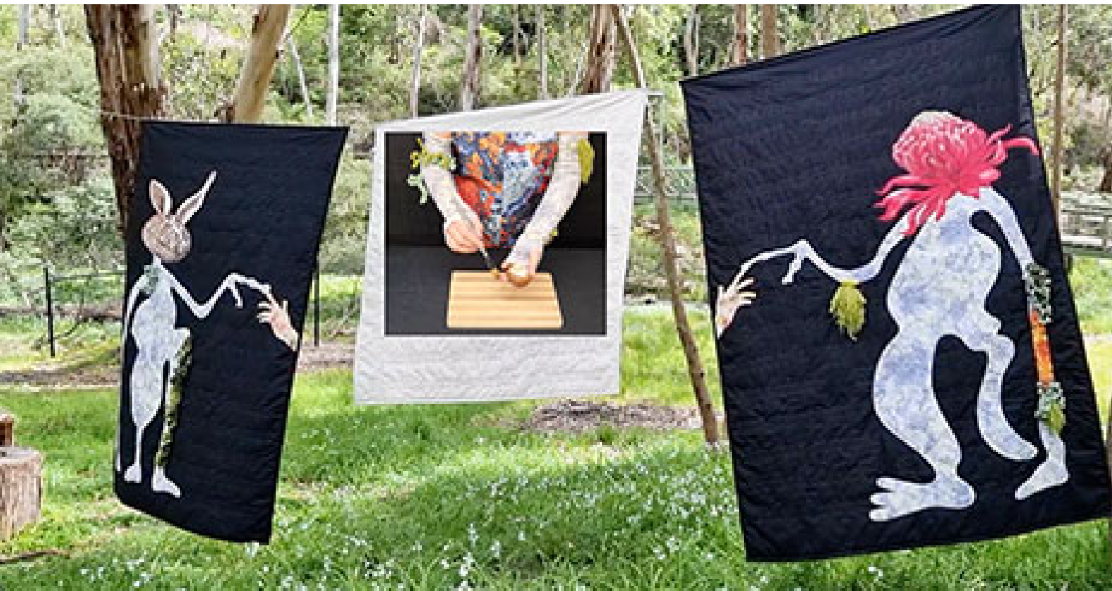
Figure 14: Installation view at Mullum Mullum trail, Melbourne, 2021.

the essential partnerships is food consumption, an important part of the ecosystem. Through the performance, I aspire to tell the story of a partnership (between all-other-beings and me) based on mutual respect and understanding by making a meal with mushroom, lettuce, capsicum, lemon, oil, knife, fork, bowls, and plates. My respect and care towards these non-human partners are projected through my body movement and the food presentation.