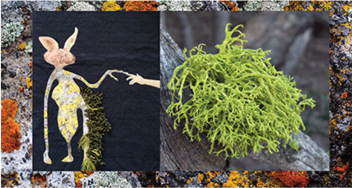
Figure 2: Lichen Symbiont quilt and fruticose lichen collage, 2021.

The non-human part is vibrant and powerful. Together with my symbionts, I am interested in how we can creatively explore the potential for building a more just and sustainable way of life on a planet with finite resources and vitality through new symbiotic stories. Going into the second phase of this project, I incorporated lichen with animal cross human forms. As an exploration, the Children of Compost Symbionts take on many forms such as in the third phase of this project, I created a series of symbiont posters and tote bags, and later flags, quilts and video works, to raise awareness to environmental degradation, mass extinction, and climate change through these diverse public interventions. Throughout this ongoing project, I explore different possibilities of inspiring reflection and discourse on environmental and ecological justice through the agency of the symbionts.