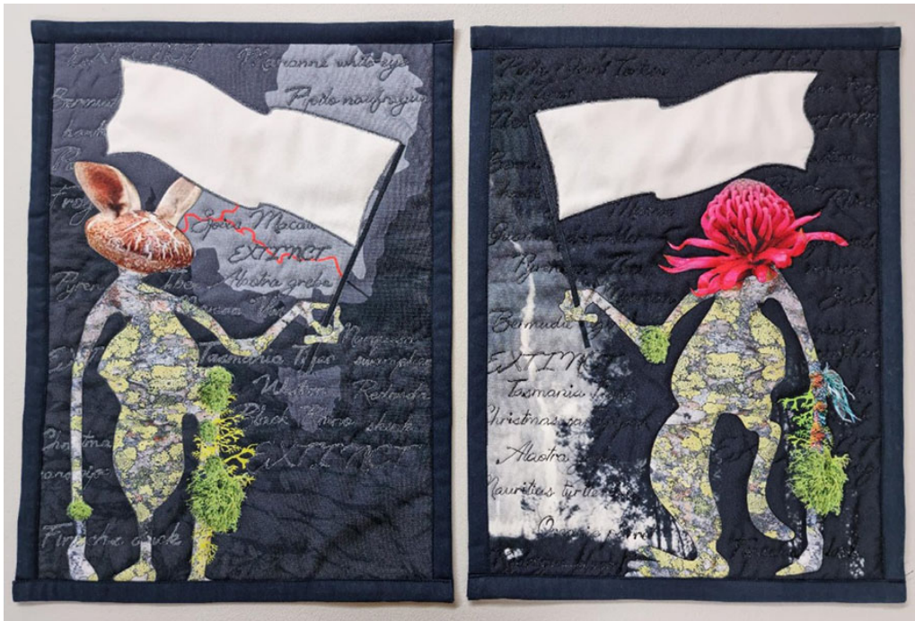
Figure 6: Extinction Quilt: Symbiosis and Metamorphoses, 2021, digital printed fabric, polyester wadding, and embroidery thread, 2 x 35cm x 47cm.