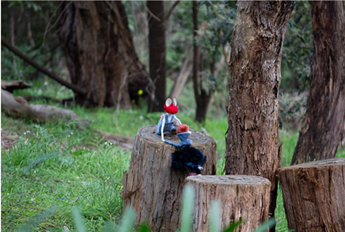
Figure 1: photograph taken at Mullum Mullum Reserve, Melbourne.