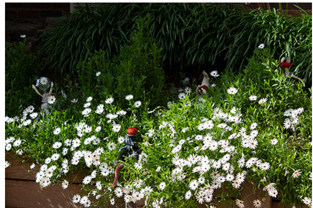
Figure 4 & 5 Photography taken at Mullum Mullum trail, Melbourne, Australia 2020.

Many contemporary artists are facilitating the escape for meaningful outcomes. The fantastic Yayoi Kusama, for example, is tirelessly bringing us to the infinite unbound universe and back. Artists like Raul De Nieves open the door of wonder and play with his shiny, bejewelled paintings and sculptures, while Cao Fei transports us to virtual