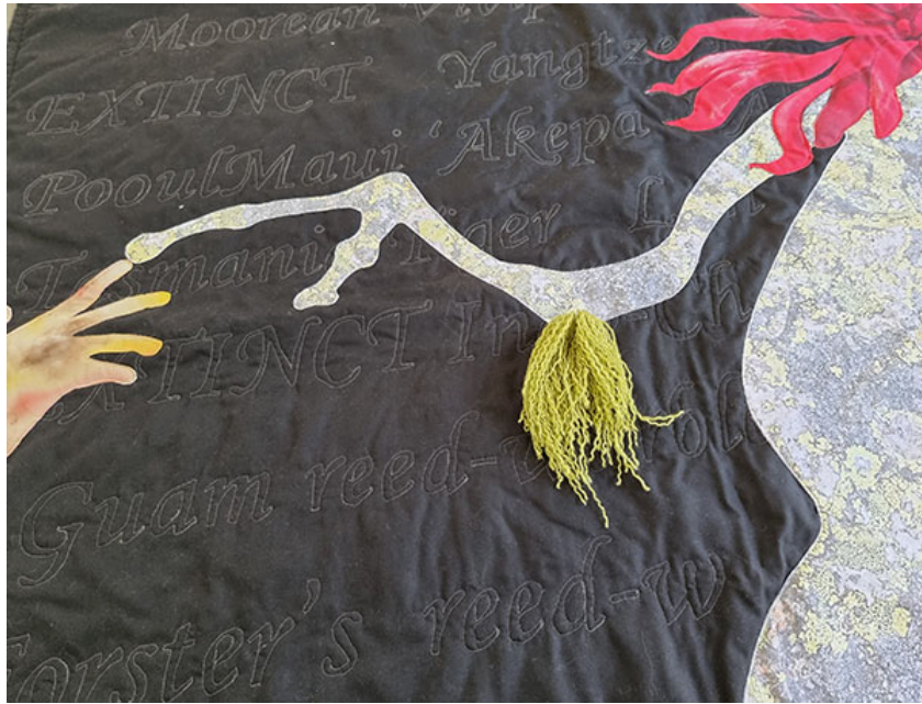
Figure 8: Part of Extinction Quilt #3, 2021, 120cm x 180cm.