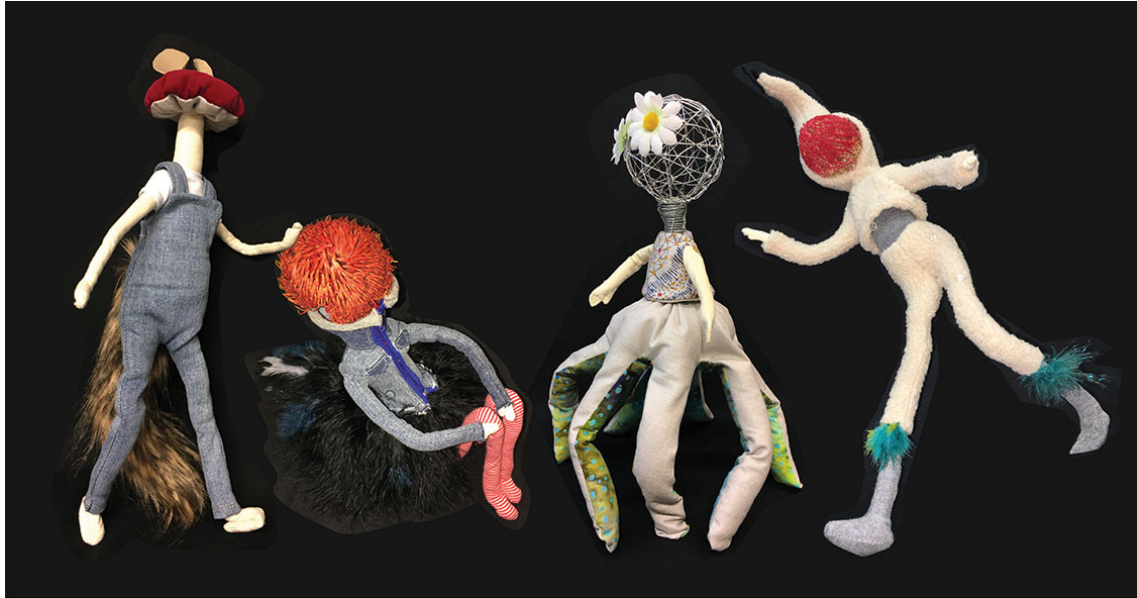
Figure 3: First Generation Symbiont Team, 2020, steel wire, fabric, feathers, dried wild flowers, polyester wadding, 1 x 46cm x 30cm x 19cm; 1 x 56cm x 14cm x 10cm; 1 x 45cm x 12 cm x 10cm; 1 x 46cm x 25cm x 25cm.

I started making the first-generation symbionts in the middle of the Covid-19 lockdown in 2020 when public space was inaccessible, while anxiety, economic hardship, and social injustice dominated the public discourse. The poor must keep working under health threats while the privileged can isolate from infection. Escape from reality becomes a way to reflect and recoup in order to come back and improve the broken systems.