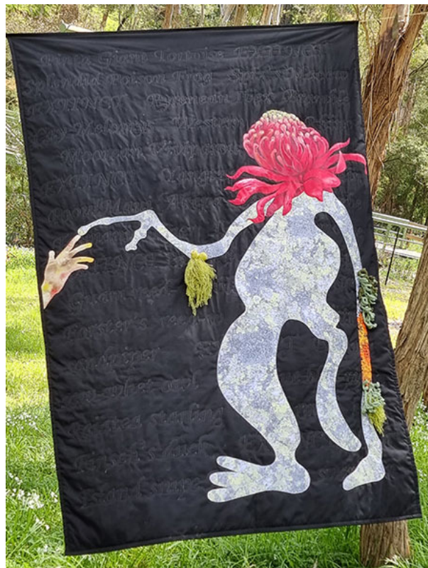
Figure 7: Extinction Quilt #3, 2021, fabric, polyester wadding, knitting yarn and acrylic paint, 120cm x 180cm.