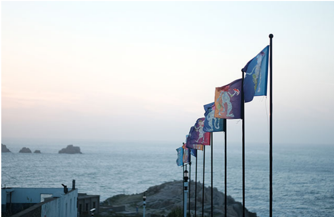
Figure 13: Installation view on Huaniao Island, China, 2021.

I extended my Finding Children of Compost project into this art installation embedding the same concept of questioning anthropocentrism and the impacts of advanced capitalism within it. I installed a group of vibrant flags with whimsical symbionts printed on them. The flags were animated by wind blowing from the sea. Eight colourful flags were installed along the seashore line. Another five flags sat a bit lower on the boats behind the front row of flags. They gave audiences a closer encounter with the symbionts. I mixed Zhoushan Archipelago-specific species with indigenous Australian elements to build the Huaniao symbiont league. The intention was to welcome and introduce Huaniao Island visitors to a non-hierarchical multispecies encounter. The work aimed to provoke the sense of wonder that dissipates boundaries and stands to build relationships, incite collective thinking in nature/culture preservation, and inspire systematic changes in the current time of the Anthropocene.