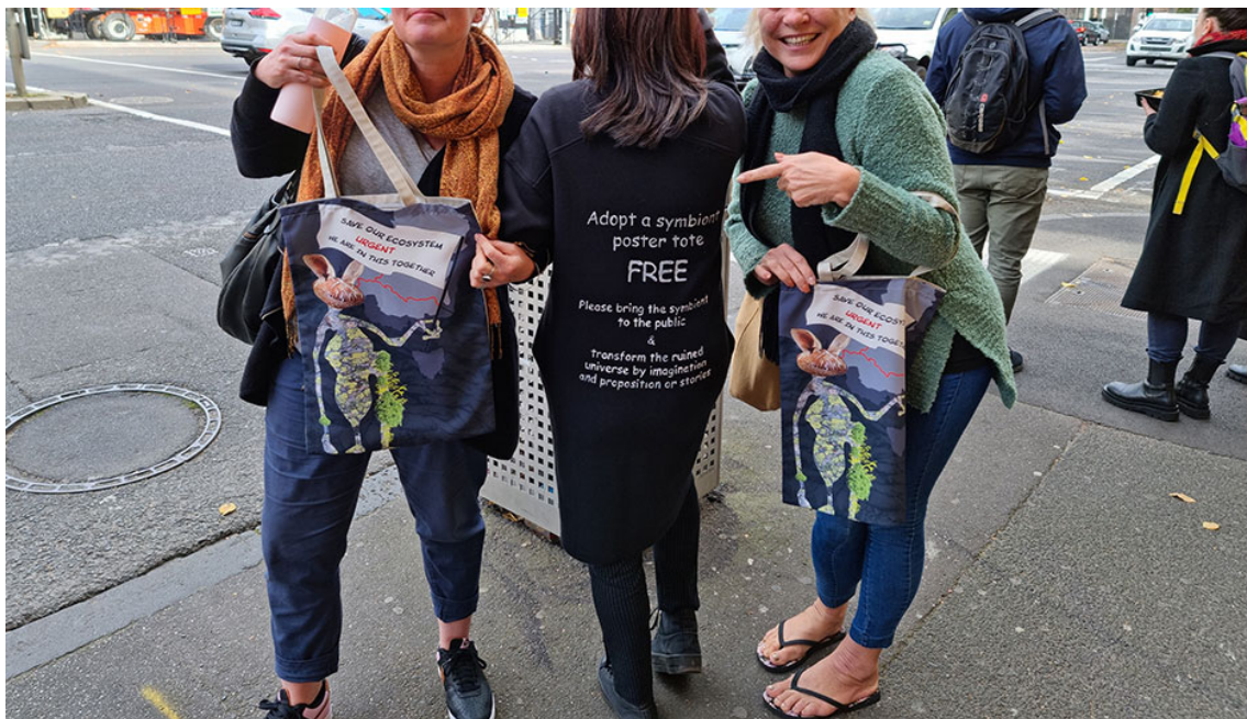
Figure 10: Tote gifting act, 2021 at Carlton, Australia.