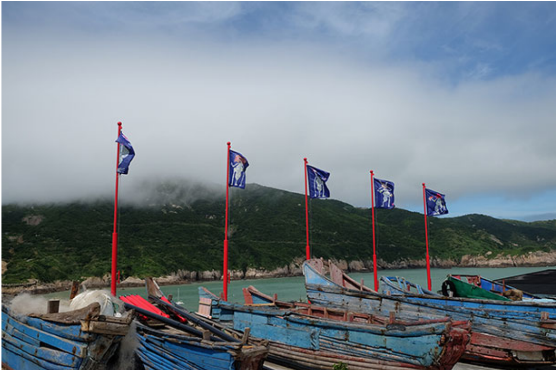
Figure 12: Installation view on Huaniao Island, China, 2021.

From Italy to China and the Huaniao Island Public Art Festival 2021. Huaniao Island is a quiet and picturesque island approximately four hours by boat from Shanghai. It's small and aging community lives within a distinctive ecosystem and a traditional fishing culture undergoing social/economic changes brought about by the introduction of the tourist industry. The challenges imposed on environmental and cultural preservation are immanent. The rich ecosystem of the Zhoushan Archipelago, where Huaniao sits, houses many endangered species, namely the tree species Carpinus Putoensis . 2 This festival was a pilot project to engage artists and the public in creative placemaking to revitalize the culture and economy of this place.