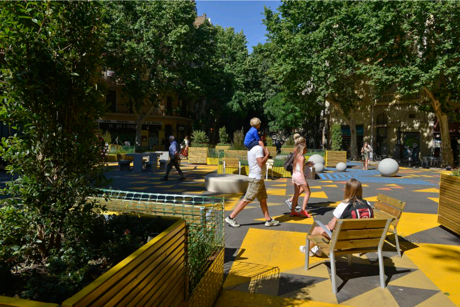
Figure 5. Superblock Sant Antoni at the intersection of Comte Borrell and Parliament.

However, this model is difficult to scale for the entire city. Superblock version 4.0 is nearby, in front of the Sant Antoni Market at Comte Borrell and Tamarit. Here we see a permanent version of a Superblock intersection, with a full street re-design and formal pedestrianization. The intersection has four large trees, including a jacaranda and oak, planted in a new public space previously devoted to vehicle traffic. From an urban design perspective, version 4.0 is scalable for the entire city.