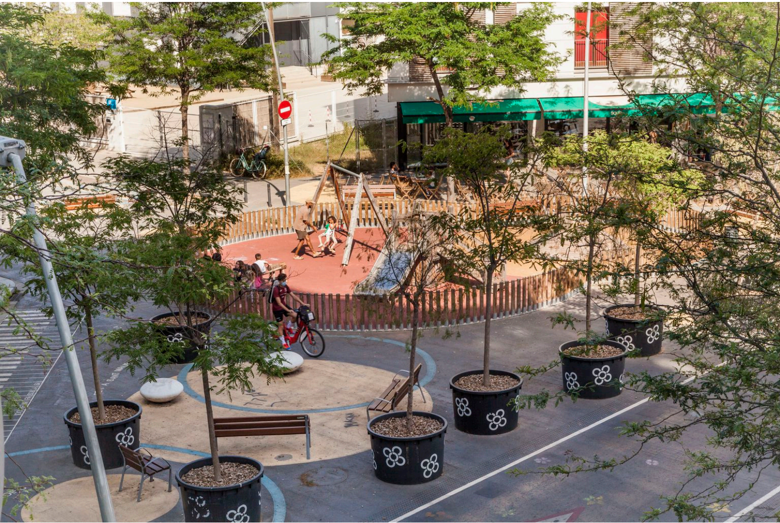
Figure 4. Superblock playground at the intersection of Roc Boronat and Sáncho de Avila in Poblenou.

Most of what has been written about Barcelona's Superblocks until now has focused on the nine-block archetype. However, the notion of the Superblock in Barcelona has evolved. The beta version of Barcelona's Superblock was developed by architecture students at the Poblenou site in September 2016, and this urban experiment most closely resembles the classic superblock archetype. Since then, the idea has undergone modifications. This city improved on the student proposal and version 2.0 is what we see in Poblenou today (Figure 4).