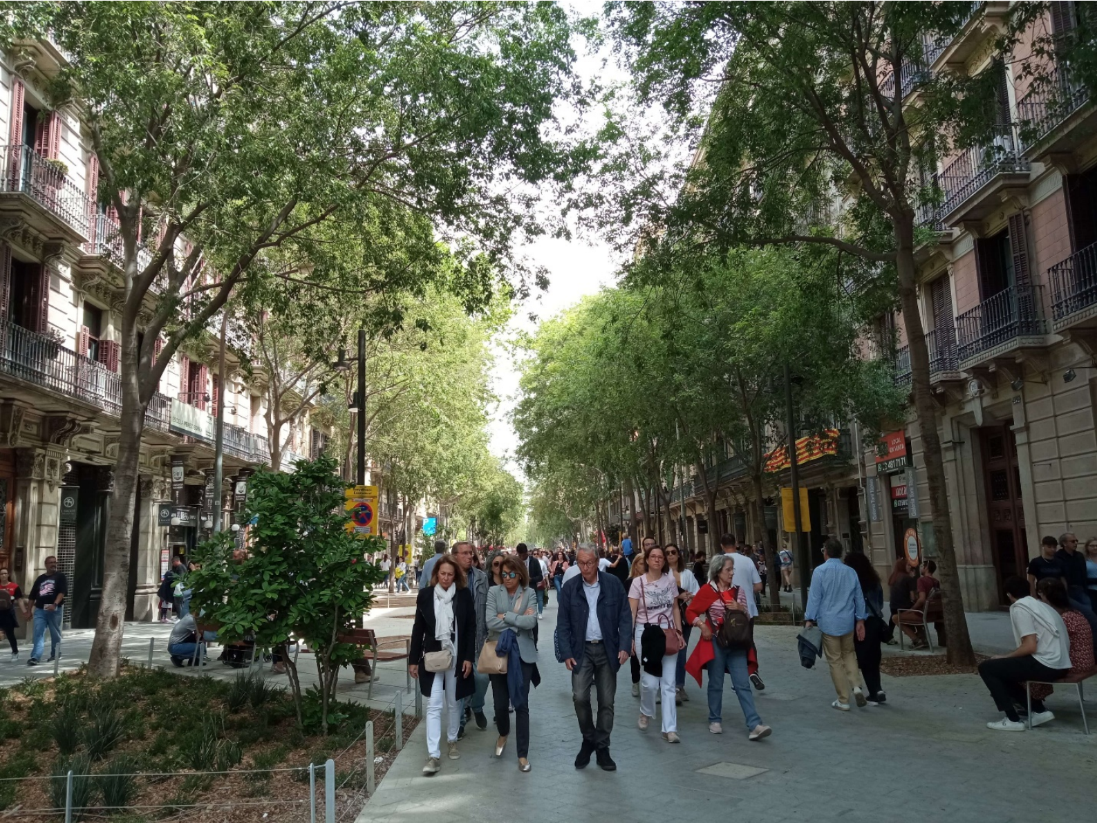
Figure 6. The pedestrianization of Consell de Cent as part of Superblock Barcelona aims to reconceptualize the typical street in Barcelona's urban grid.