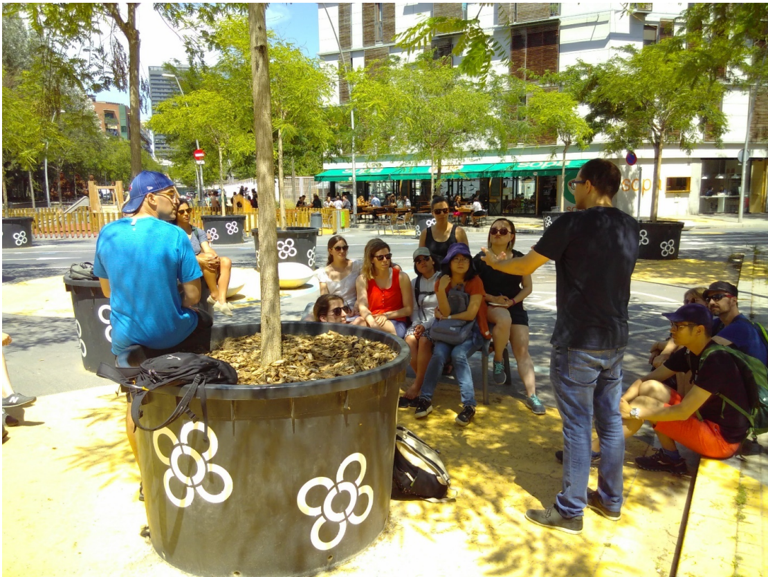
Figure 3. Students from the University of British Columbia (Vancouver, Canada) learning about the Superilla pilot in Poblenou in June 2018.