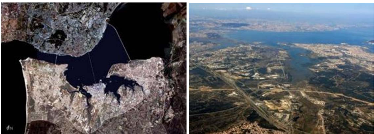
Fig. 1. South Bank in Lisbon Metropolitan Area. (A) orthophotomap and (B) aerial view.

Therefore public space should be considered, not as a sum of isolated space types, but as a network of places (Pinto & Remesar, 2012) with shared set of properties, interdependences and interactions, in a systemic perspective, fostered by functional and morphological sense. New multidimensional facts under the theoretical principle of urban space continuity in space and time, may answer to present dilemmas: growth of scale and distance (dispersion); growth of complexity and diversity (indeterminacy) and growth of non-systemic actions (disruption) in today’s city call for more integration of a system of public spaces at the centre of urban transformation processes (Pinto & Brandão, 2015). A conceptual and operational matrix aims to interpret these spaces in unstable, disconnected, or unforeseen contexts, by mapping urban qualities focusing on the basis of urban spatial continuity, and testing urban systems with structuring potential.