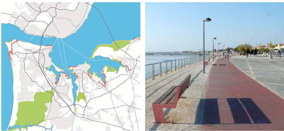
Fig. 4. Waterfront South Bank spaces (A) mapping spaces and connections; (B) urban park view.

Major perceptual and image changes made in urban landscape along the system may suggest new interaction possibilities by establishing a strategic development axis improving urban and landscape quality, fostering gradual connections within Almada, by linking several parts and promoting urban mix. Further expansion of the light rail network could extend this continuity to other territories, increasing users and their interactions, focusing on multipurpose links.