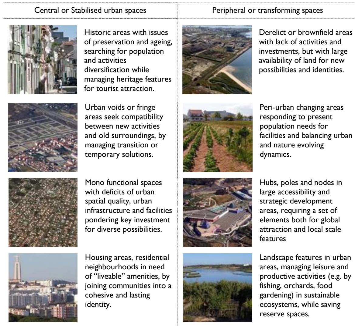
Tab. 1. Examples of urban instability indicators in the South Bank area.

d) In the 1990's a second bridge was built to reinforce national and metropolitan accessibility system, but the location decision was untied to regional planning options. The connection transformed the metropolitan structure and relations: new accessibility reoriented urban and population growth to a more polycentric model, favouring less urbanised territories. Later, planning instruments supported urban expansion - residential schemes, logistic areas, commercial spaces, etc. - but lacked scheduled programming actions of urban design. Near road accesses expanding urban perimeters, generated new fragments and voids. Could occupation flexibility over time be balanced with structuring elements of urban relation?