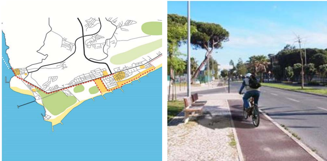
Fig. 2. Trafaria-Caparica cycle path connection (A) mapping uses and connections; (B) avenue insertion view.

The relative “lighter, quicker, cheaper” way of developing a connection like this can be used to create a network of further connections fostering public uses and active modes of transportation, that may be diversified and complemented by adding elements from other transports, natural and social systems, connecting other proximity realities.