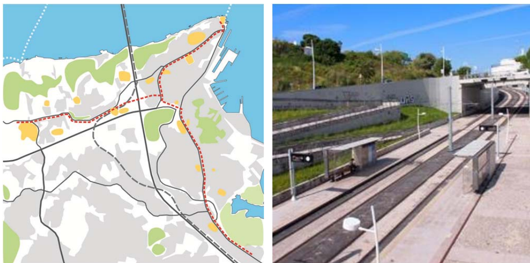
Fig. 3. Light rail transit (A) mapping connections and urban spaces; (B) station with poor urban insertion.

b) Developed to link the main urban nucleus of the riverside area, a light rail transit network (Fig. 3) aims to surpass the deficits in the mobility systems. Financial and operational constraints limit the network to Almada municipality connecting the city centre, other centrality areas and transport hubs through a diversified urban structure. Strong urban growth followed disconnected and individual developments with few