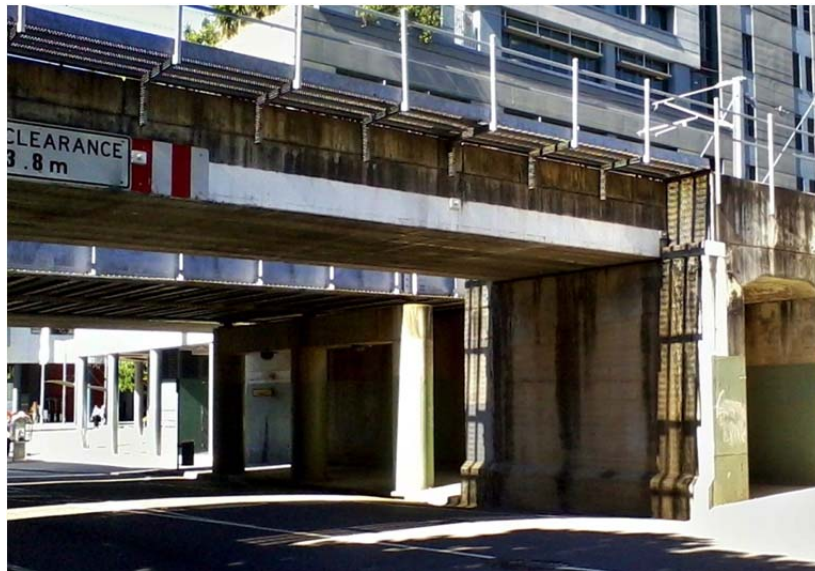
Figure 2. Ernest Street Tunnel, South Brisbane.

and future use of the site/s. If appropriate there may be opportunities within the artwork development phase by the selected artist/s to involve the community in some form of creative engagement to generate some components and/or content for the new artwork/s.