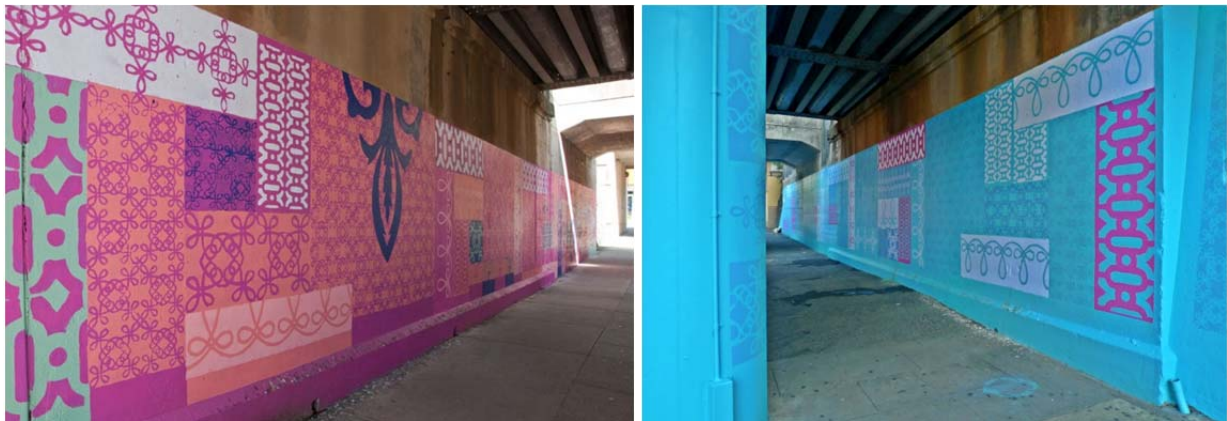
Figure 3 (left). Ernest Street Tunnel, South Brisbane. Pink wall. Figure 4 (right). Ernest Street Tunnel, South Brisbane. Blue wall.

With motifs sourced from the decorative trim of railway uniforms Ridley succinctly articulates the qualities of the site. The insignia and emblems were magnified and transferred to the site using large stencils and the result is reminiscent of tiling or wall paper to address the conflicting scales in the site.