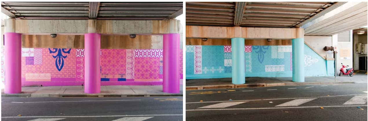
Figure 5 (left). Ernest Street Tunnel, South Brisbane. Pink wall. Photo credit: Rod Buchholz. Figure 6 (right). Ernest Street Tunnel, South Brisbane. Blue wall. Photo credit: Rod Buchholz.

With motifs sourced from the decorative trim of railway uniforms Ridley succinctly articulates the qualities of the site. The insignia and emblems were magnified and transferred to the site using large stencils and the result is reminiscent of tiling or wall paper to address the conflicting scales in the site.