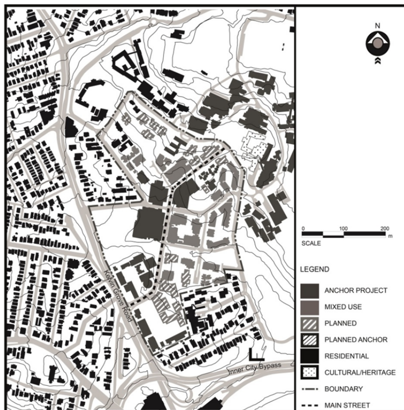
Fig. 2: Boggo Road knowledge precinct [Diagram by Guaralda M. (2013)]

An investigation of case studies leads to identification of ‘permeability’ as a major attribute that define public spaces of contemporary KISs that contributes in facilitating a progressive sense of place making for knowledge workers. More importantly, permeability refers not only in spatial but also in economic, social and environmental terms—as evident in both the cases.