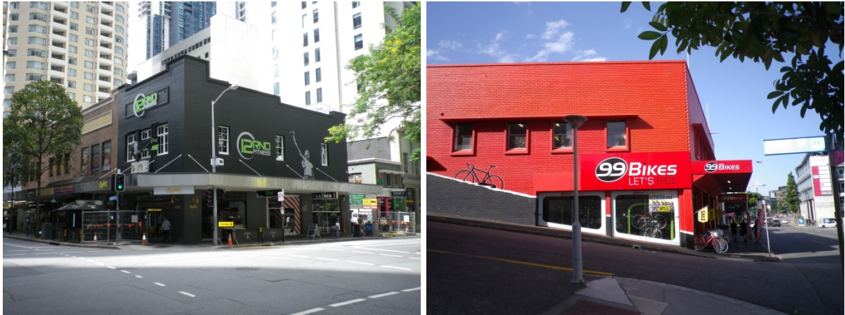
Fig. 3. Expression of brand-related colours on buildings in Brisbane.