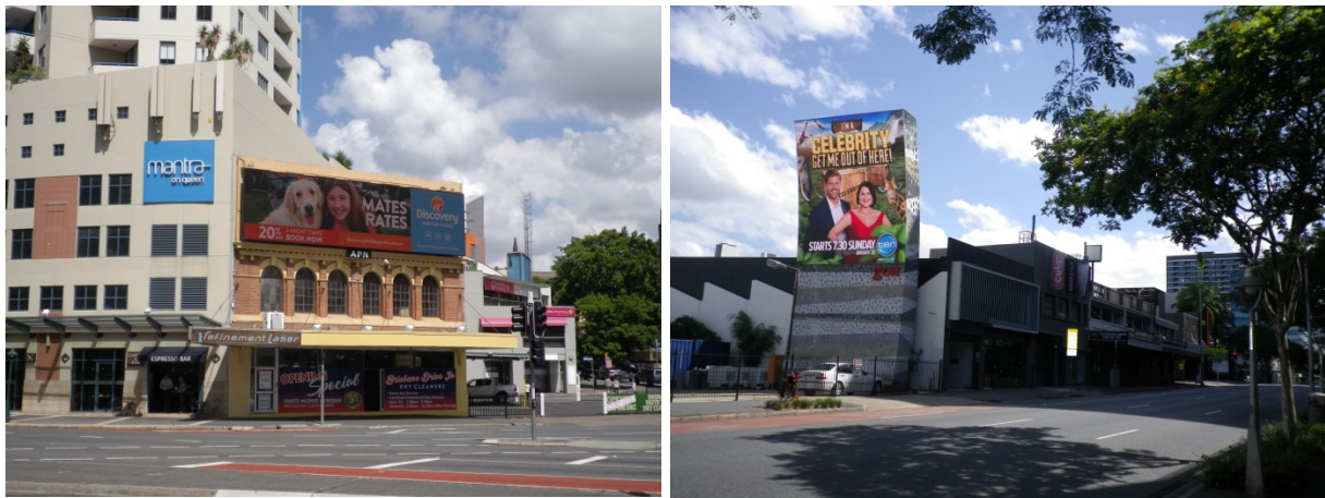
Fig. 2. Large digital board installations in Brisbane. These are found (a) on the roof of a historical building and (b) ground-standing digital board attached to a building used as a background.

compared to those in the city of Brisbane, Australia. The rapidly increasing complexity of ECCs in contemporary cities could be mainly attributed to changes in the density and volume of built forms; intervention of large-scale digital billboards and urban art installations; use of innovative colour-changing and highly reflective materials; development of new lighting technologies and the introduction of media facades. In the Brisbane context, the media facades and laser light projections on buildings remain limited and circumstantial. In contrast, giant advertising boards frequently appear on the ground, midsections of high-rise buildings and even on the rooves of heritage buildings. In some cases, the dimensions of such boards are almost equal to or bigger than the host building itself (see Figure 2). The saturated and flickering images of a digital billboard may overpower architectural colour, create colour dissonance and affect the visual experiences of both pedestrians and vehicle commuters. When installed on historical buildings, these boards may compromise the historical and cultural value of the public space or produce undesirable symbolic associations.