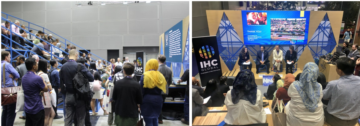
Fig. 4-5. IHC Global's 'Smart City, Just City' event at the 9 th World Urban Forum, hosted at the Next City World Stage.

This launch event was intended to be the first in a series of strategic efforts, planned for the coming year, designed to bring together the two separate narratives common within the discourse on urban development. The “Smart City” movement focuses on harnessing data and technological advances to make cities function in a more efficient, integrated, and sustainable manner. The ‘Just City’, in this case, refers to various discourses, which include “the right to the city” and which focus on cities that are inclusive and equitable, in which everyone is able to participate and to shape the urban experience, and in which services and infrastructure investments are designed to foster greater opportunity for all, including the most vulnerable. This new initiative will seek to show that the smart city can be the just city, and the just city can be the smart city, and will specifically highlight ways in which the two concepts can be symbiotic.